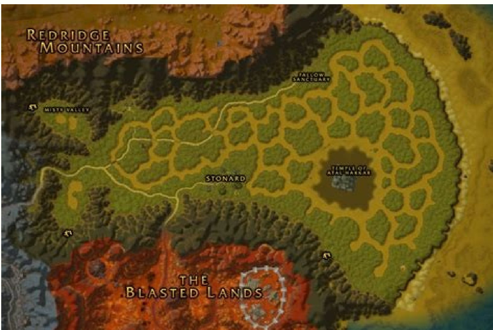
Vanilla wow horde lockpicking leveling guide.